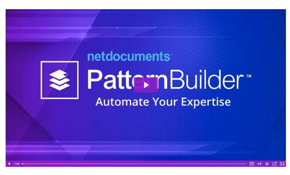
Click to watch how you can automate your expertise with NetDocuments' PatternBuilder

that take you away from more important work are done by the software. Your lower-end services can be built into apps presented via hyperlinks for clients or staff to complete.